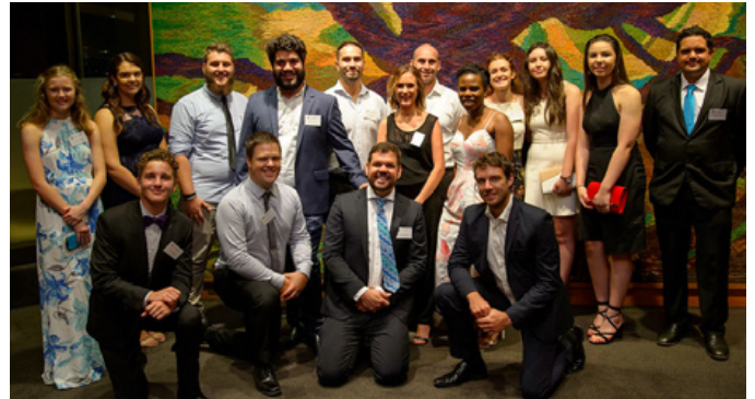
Former IAESS students, who are now undergraduates and young Engineers, came from all over the country to attend our anniversary celebrations

Past and present students then joined guests at the EAA 20th Anniversary dinner which was held at Parliament House.