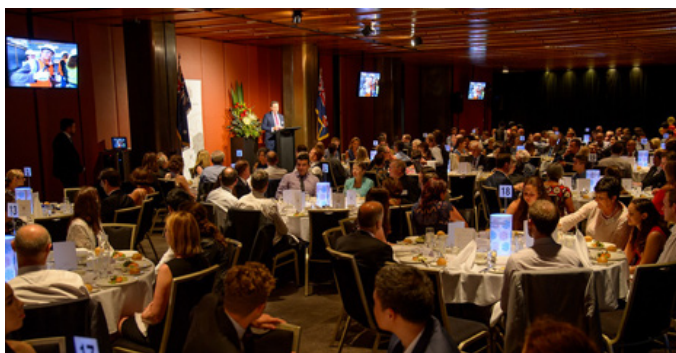
EAA's 20th Anniversary Gala Dinner at Parliament House